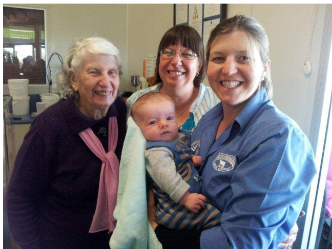
“4 generations at the Alexandrina Cheesery!”